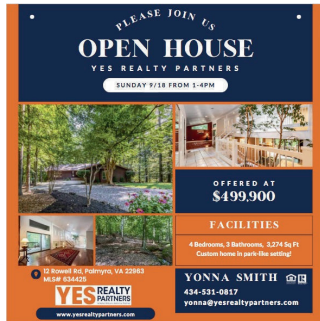
Social Media Collateral

Develop a series of eye-catching social media posts for Coming Soon, Just Listed, and Sol